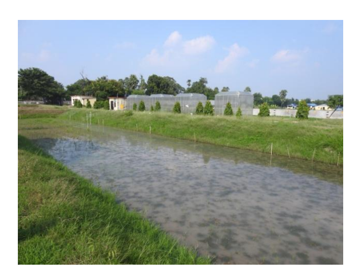
A view of submergence plot (after de-submergence) with no surviving rice plant

Rice genotype 'TP30495' is identified to be tolerant to complete submergence of 21 days at early vegetative phase (42 days after sowing). The genotype has its origin in IRLON 2016 Set 1 received from the International Rice Research Institute. Manila, Philippines. Among the 18 rice genotypes in the set, TP30495 was the only genotype which could regenerate after submergence. Even the Swarna sub1, which was used as the submergence tolerant check, was unable to regenerate. Thus TP30495 could be new submergence tolerant rice with better submergence tolerance than Swarna sub1.