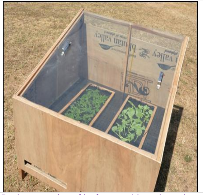
Drying operation of leafy vegetables using solar dryer

The dryer has a capacity of drying 2.5 kg leafy vegetables per batch. Drying curves (time Vs moisture content) were developed for different underutilized leafy vegetables