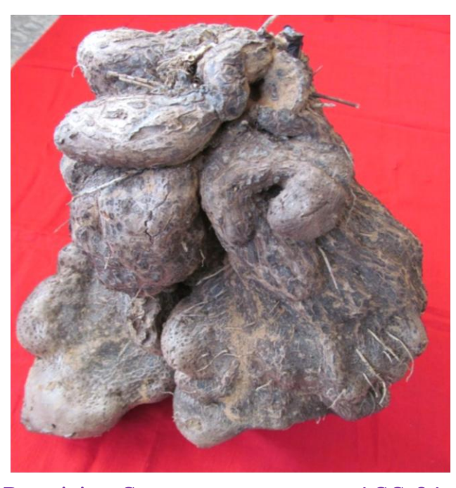
Promising Grater yam genotype ACC-34

district of Chhattisgarh recorded the highest mineral content. The anti-oxidant activity ranged between 98.86 to 392.64 mg AEAC/100g FW of tuber. The released variety Orissa Elite recorded the highest anti-oxidant activity. Among the seven genotypes, ACC-34 was very promising for tuber yield and promising for total mineral content of tuber and can be promoted under tribal farming system in Eastern Plateau and Hill Region.