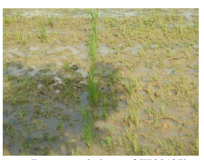
Regenerated plants of 'TP30495'