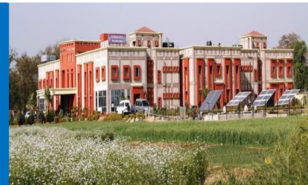
Administrative building cum Laboratory, ICAR- RCER, Patna

Free boarding and lodging, as per the Ministry of Agriculture approved norms will be arranged in the Institute Guest house for all the participants. The selected participants will be paid for the journey, to and fro, restricted to AC-II tier fare or bus as the case may be as per approved norms (for State Govt. Officials only) . Trainees from ICAR, SAU's, KVKs etc. have to claim their TA from their respective organization. However, all participants are entitled to avail the lodging and boarding and other facilities. The location Patna, which is well connected by air, rail and road to the major cities of India, The Patna railway station is approximately 10 km and bus stand is about 14 km from the Institute. Important landmark for reaching the Institute is Patna Airport and Bihar Veterinary College which are located within 1 Km distance from the Institute.